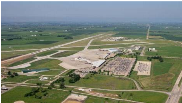
The Eastern Iowa Airport near Cedar Rapids, Iowa, aerial photo looking west with runway construction work on left side and Wright Brothers Boulevard lower right side, 6/23/2006.