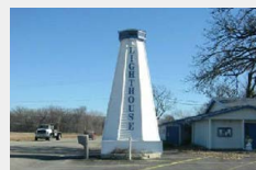
BEST Romantic Restaurant