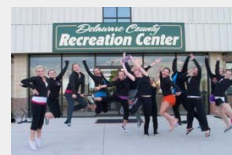
BEST Dance Studio