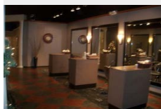
BEST Hair Color